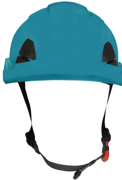
(Front with Chin Strap)