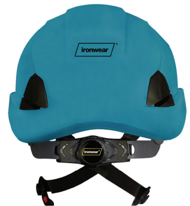
(Back with Ratchet)